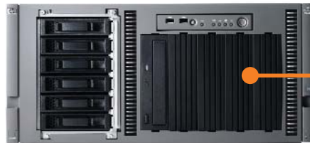
HP ProLiant ML350 G5 Server (rack unit)