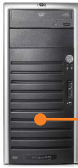
HP ProLiant ML110 G5 Server for 0-10 users